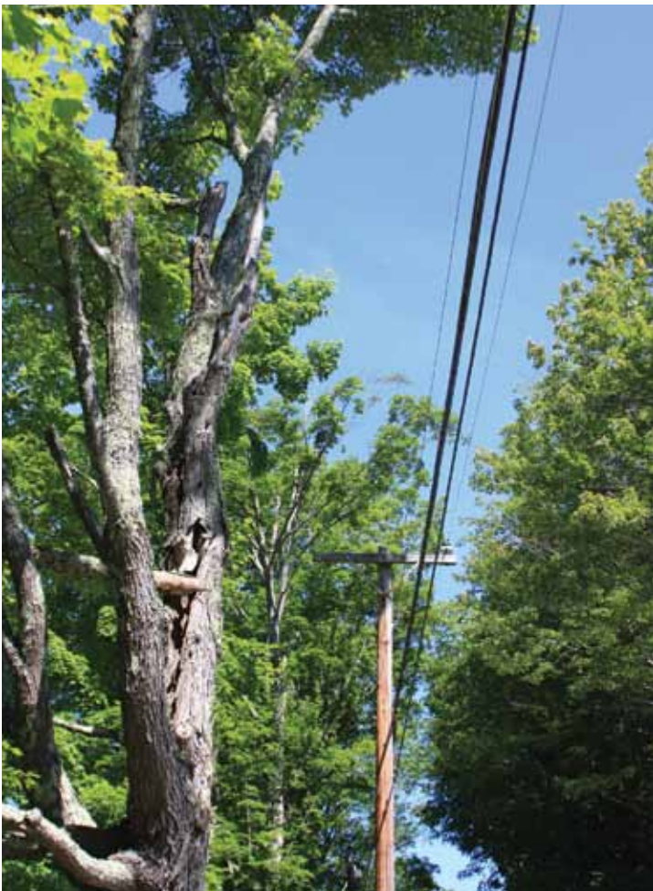
Figure 1. The tree risk program was designed to avoid tree-failure-related outages that might occur under "normal" weather conditions. The decay in this sugar maple ( Acer saccharum ) scaffold branch would increase the likelihood of failure under such conditions.