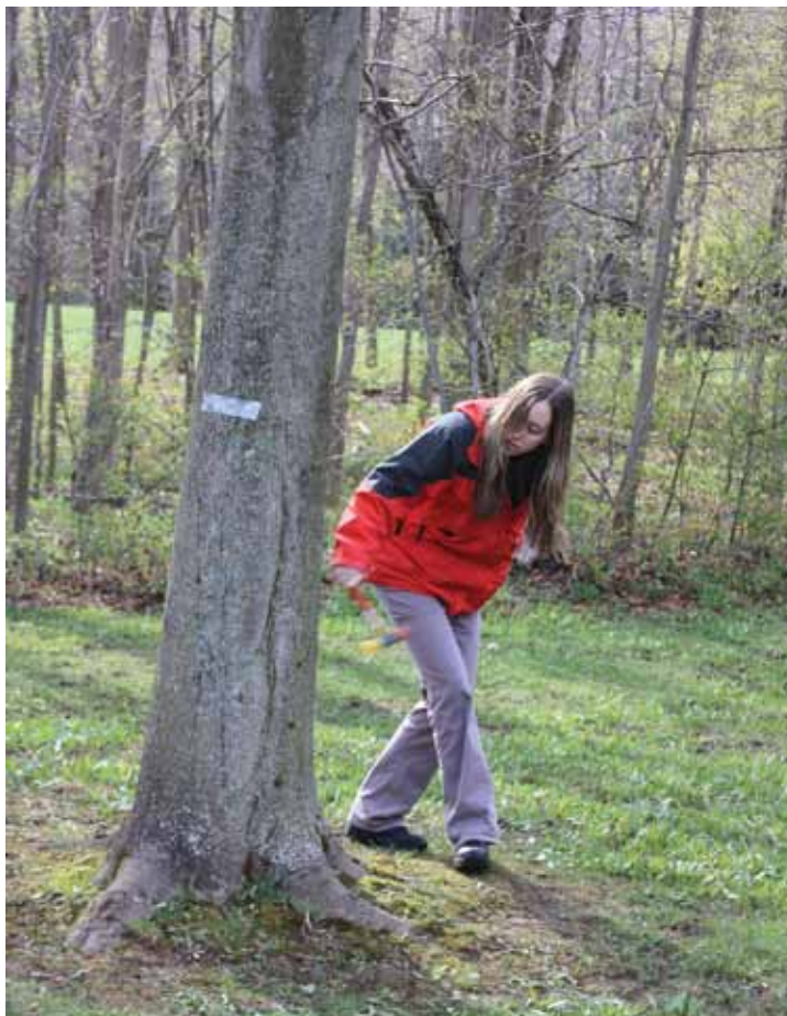
Figure 5. The program promotes consistency of assessment among assessors and defines the assessment methods used. In some cases, sounding with a mallet for decay is required.

ANSI. 2006. Tree, shrub, and other woody plant management standard practices. Integrated vegetation management. a. Electrical utility rights of way. ANSI A300 (Part 7) . ANSI, Washington, D.C. 16 pp.