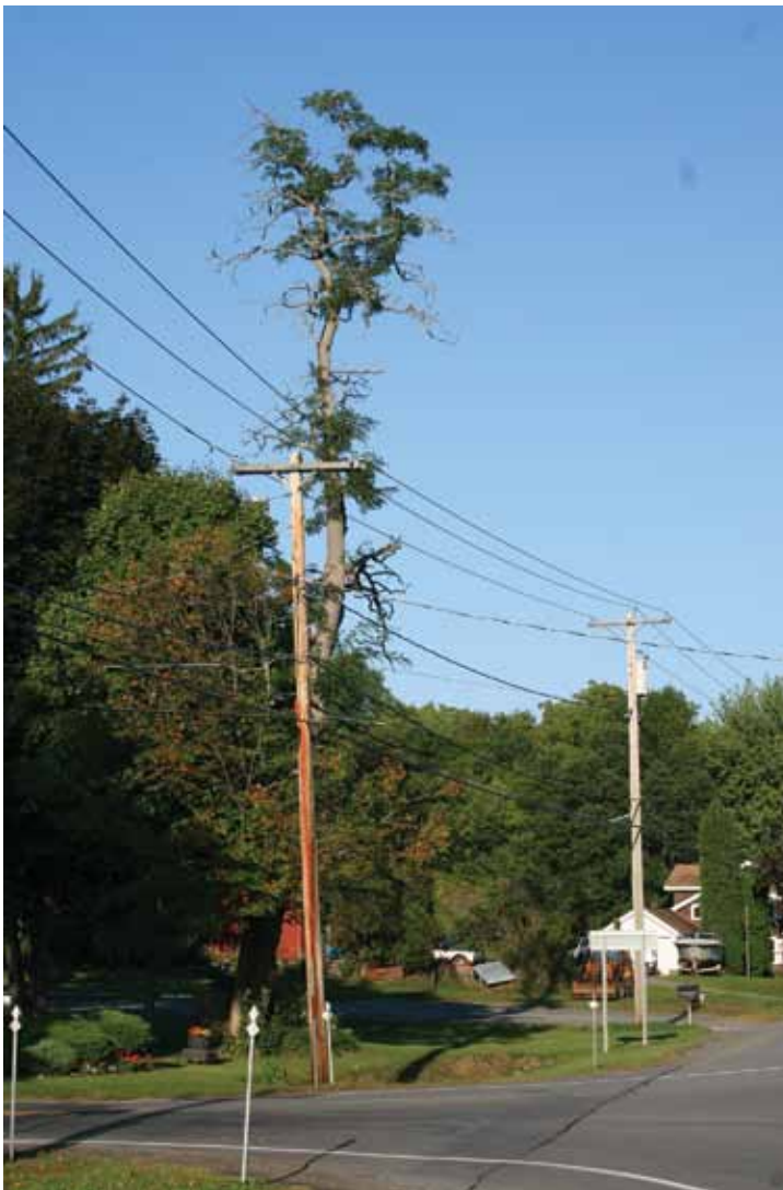
Figure 4. Risk modifiers (e.g., site, exposure, species, tree health) that affect the likelihood of failure or target impact were developed to allow the risk assessor to account for these important factors in the field. Here, this leaning black locust ( Robinia pseudoacacia ) shows a crown with traits of critical health and lacking damping lateral branches—traits that would bear on the evaluation of risk by raising the failure potential.

Specific action levels bring the double advantage of improving the recognition and interpretation of defects, on the one hand, and reducing the work necessary on the other. Note the effect of avoiding the unexamined label, “hazard tree,” in the situation represented in Figure 3. Conducting an actual risk assessment succeeded in 1) identifying and understanding the indicators of sapwood decay fungi (Luley 2012), and 2) distinguishing between “imminent” and “probable.”